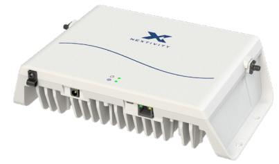
CEL-FI GO G51

Bringing the power of the macro 5G network indoors, CEL-FI GO G51 solves coverage challenges for the shorter range of mid-band 5G NR. The system delivers industry-leading signal gain up to 100 dB to overcome mid-band 5G NR coverage challenges that no other solution can. In addition to unmatched performance, GO G51 is compact, easy to use, and does not require manual configuration, making it easier than ever before for building owners to equip their buildings with 5G connectivity and ensure better voice quality, 5G data speeds, and fewer dropped calls. GO G51 is perfect for small- to medium-sized buildings, operator-approved, unconditionally network safe, and offers the flexibility to support various 2G/3G/4G and 5G cellular networks.